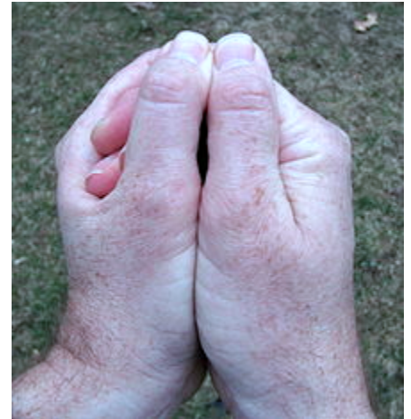
The air is blown between the thumbs into the hand.