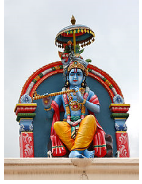
Statue of Krishna playing a flute