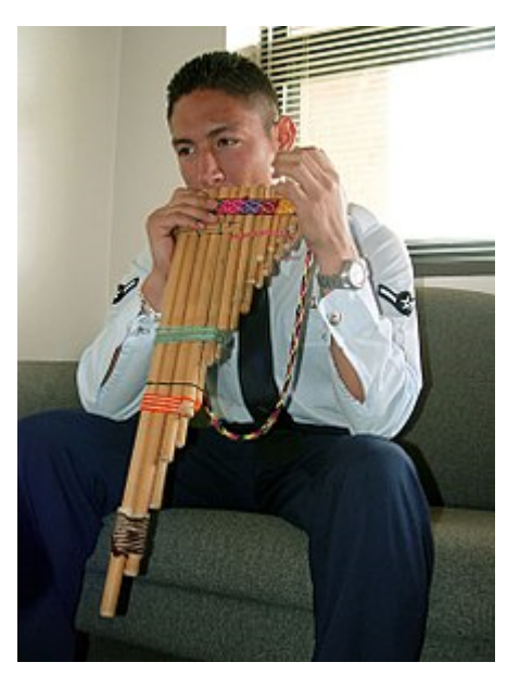
Playing the zampoña , a Pre-Inca instrument and type of pan flute.

Another division is between side-blown (or <u>transverse</u>) flutes, such as the Western concert flute, <u>piccolo</u>, <u>fife</u>, <u>dizi</u> and <u>bansuri</u>; and <u>end-blown flutes</u>, such as the <u>ney</u>, <u>xiao</u>, <u>kaval</u>, <u>danso</u>, <u>shakuhachi</u>, <u>Anasazi flute</u> and <u>quena</u>. The player of a side-blown flute uses a hole on the side of the tube to produce a tone, instead of blowing on an end of the tube. End-blown flutes should not be