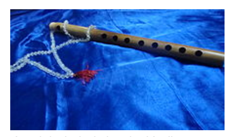
An eight-holed classical Indian bamboo flute.

traditionally considered a master of the bamboo flute. The Indian flutes are very simple compared to the Western counterparts; they are made of <u>bamboo</u> and are keyless. <sup>[40]</sup>