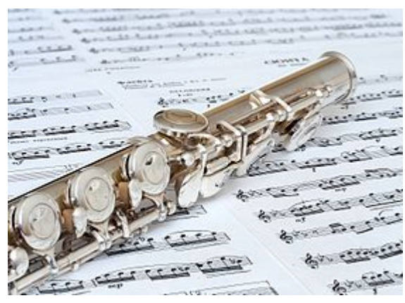
Western concert flute

Usually in D, wooden transverse flutes were played in European classical music mainly in the period from the early 18th century to the early 19th century. As such the instrument is often indicated as <u>baroque flute</u>. Gradually marginalized by the Western concert flute in the 19th century, baroque flutes were again played from the late 20th century as part of the <u>historically informed performance</u> practice.