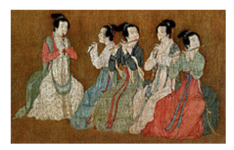
Chinese women playing flutes, from the 12th-century Song dynasty remake of the Night Revels of Han Xizai , originally by Gu Hongzhong (10th century)

The oldest flute ever discovered may be a fragment of the femur of a juvenile cave bear, with two to four holes, found at Divje Babe in Slovenia and dated to about 43,000 years ago. However, this has been disputed. [14][15] In 2008 another flute dated back to at least 35,000 years ago was discovered in Hohle Fels cave near Ulm, Germany. [16] The five-holed flute has a V-shaped mouthpiece and is made from a vulture wing bone. The researchers involved in the discovery officially published their findings in the journal Nature, in August 2009. [17] The discovery was also the oldest confirmed find of any musical instrument in history, [18] until a redating of flutes found in Geißenklösterle cave revealed them to be even older with an age of 42,000 to 43,000 years. [3]