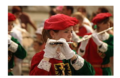
Center: Piccolo. Right: larger flute

Other sizes of flutes and piccolos are used from time to time. A rarer instrument of the modern pitching system is the treble G flute. Instruments made according to an older pitch standard, used principally in wind-band