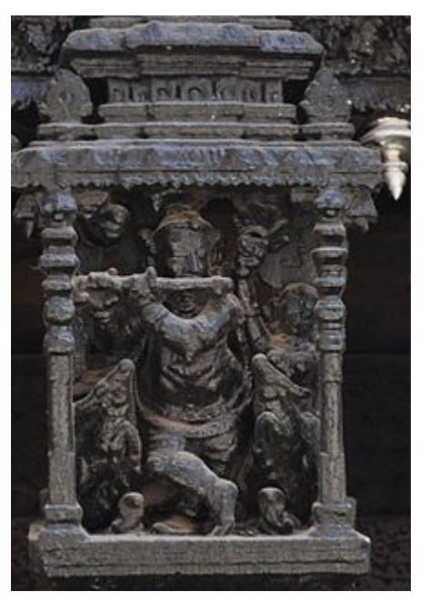
Temple car carving of Krishna playing flute, suchindram, Tamil Nadu, India

In China there are many varieties of \underline{\text{dizi}} (笛子), or Chinese flute, with different sizes, structures (with or without a resonance membrane) and number of holes (from 6 to 11) and intonations (different keys). Most are made of bamboo, but can come in wood, jade, bone, and iron. One peculiar feature of the Chinese flute is the use of a resonance membrane mounted on one of the holes that vibrates with the air column inside the tube. This membrane is called a \underline{\textit{di mo}} , which is usually a thin tissue paper. It gives the flute a bright sound.