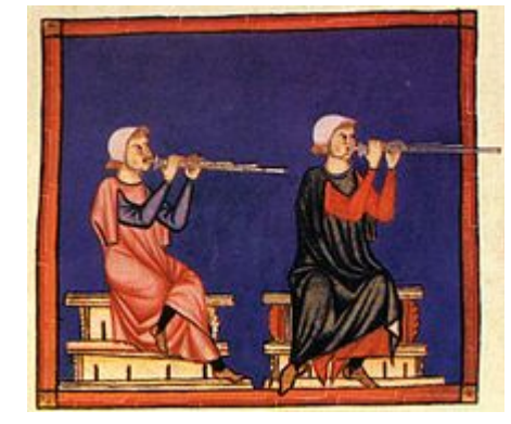
Panflute players. Cantigas de Santa Maria , mid-13th century, Spain

Head joint geometry appears particularly critical to acoustic performance and tone, [36] but there is no clear consensus on a particular shape amongst manufacturers. Acoustic impedance of the embouchure hole appears the most critical parameter. [37] Critical variables affecting this acoustic impedance include: chimney length (hole between lip-plate and head tube), chimney diameter, and radii or curvature of the ends of the chimney and any designed restriction in the "throat" of the instrument, such as that in the Japanese Nohkan Flute.