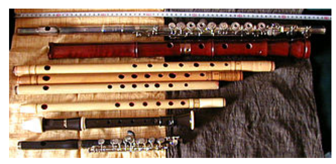
A selection of flutes from around the world

found. A number of flutes dating to about 43,000 to 35,000 years ago have been found in the <u>Swabian Jura</u> region of present-day <u>Germany</u>. These flutes demonstrate that a developed musical tradition existed from the earliest period of modern human presence in Europe. [2][3]